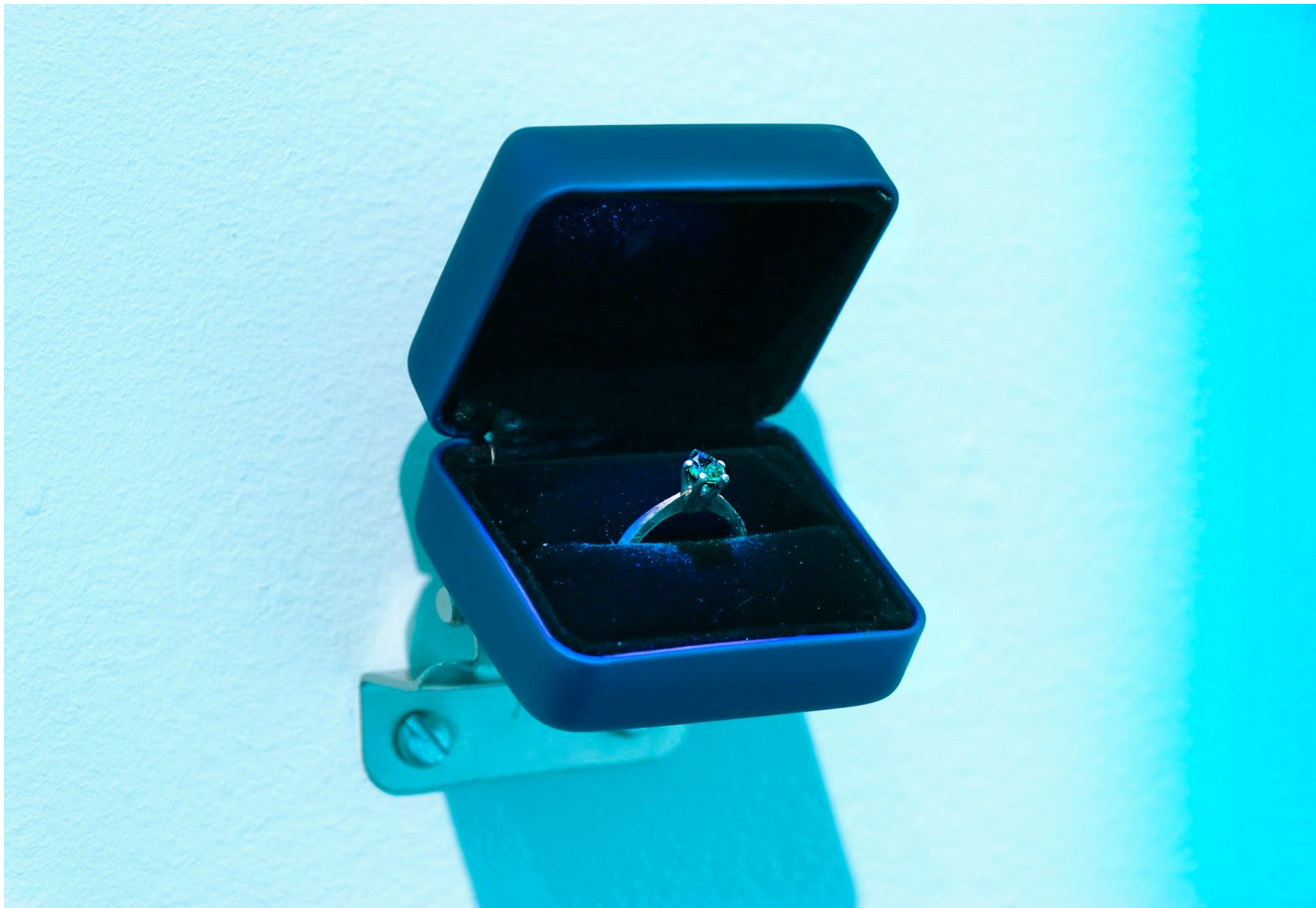
Episode (31Ga, the Snail, Melting Point 85.58°F) 2017

Gallium rings, Russian Lab created Emerald, ring box, velvet, led light