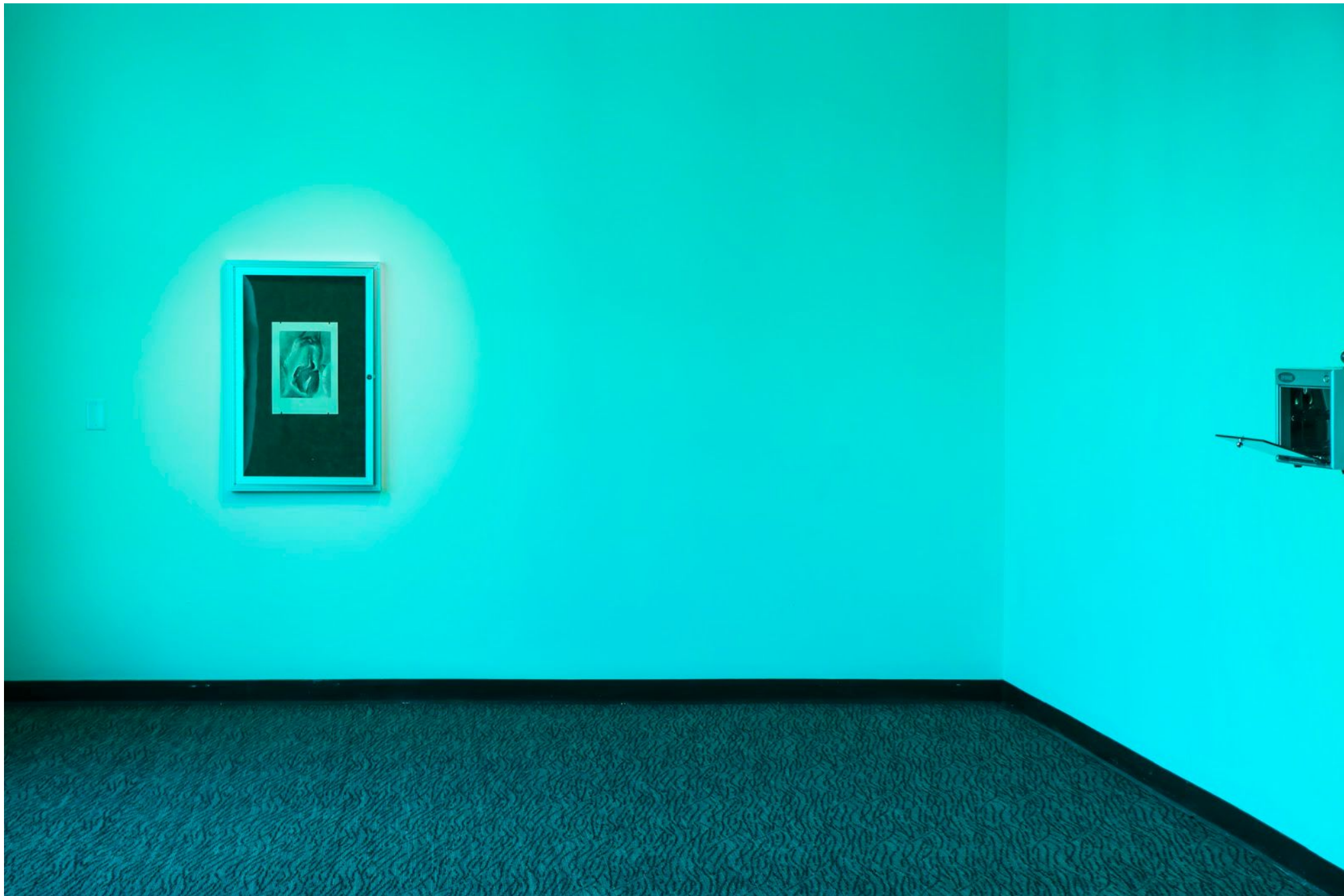
Episode (Hermaphrodites, "I love you Viskoviz") 2017

Graphite on paper, synthetic velvet, enclosed bulletin board, mother-of-pearl