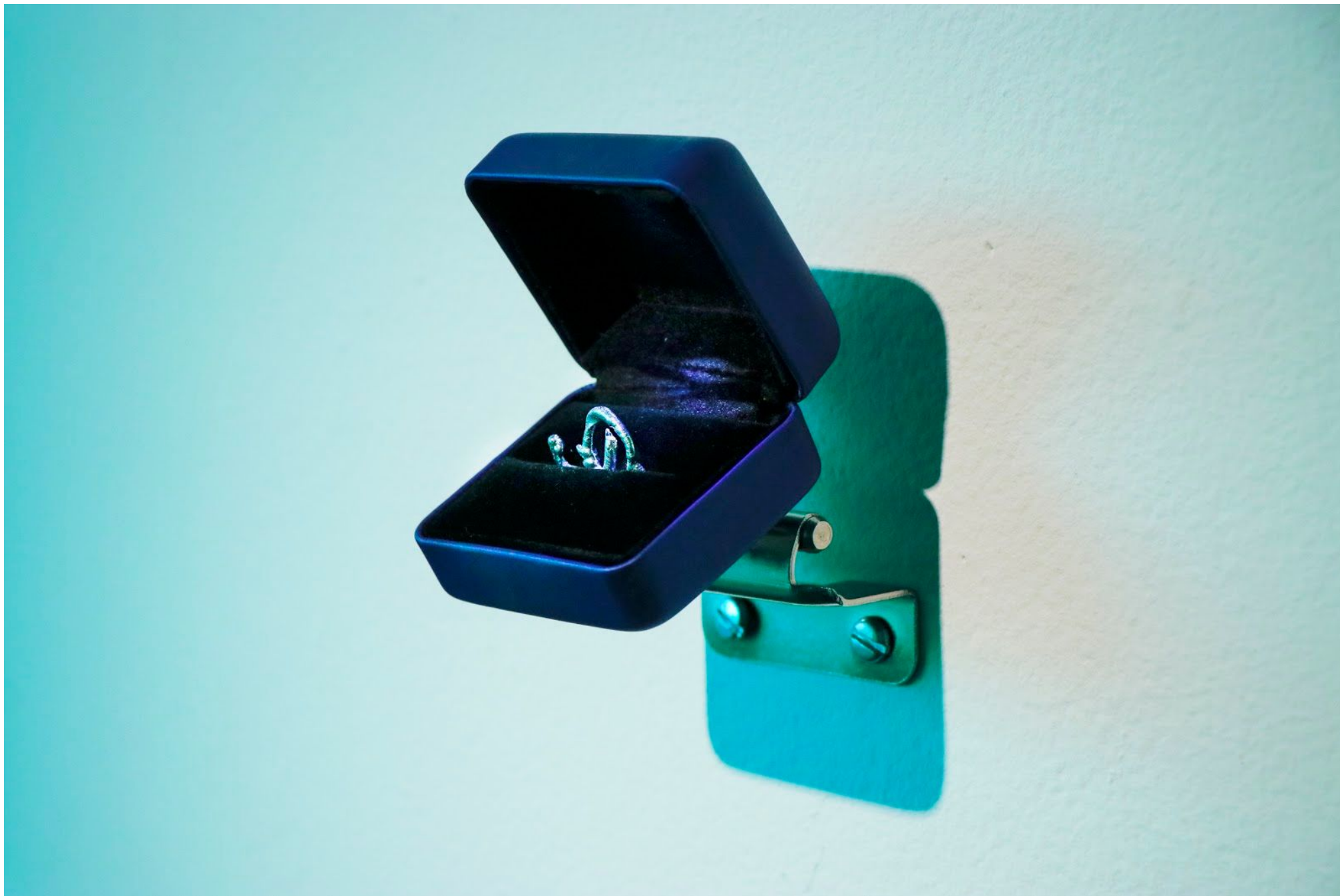
Episode (31Ga, the Snail, Melting Point 85.58°F) 2017

Gallium rings, ring box, velvet, led light