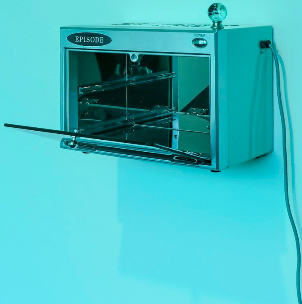
Episode (Slow Kill) 2017

UV ultraviolet germicidal antibacterial sterilizer, mother-of-pearl, Russian Lab created Emerald, sharpie drawing on crystal door knob